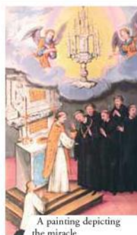
A painting depicting the miracle