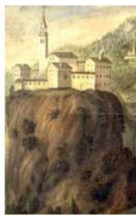
The ancient monastery of St. Georgenberg developed in two complexes, one on the mountain and the other in the valley