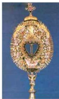
Silver and gold monstrance from 1719 in which the Precious Blood of the miracle is preserved

The little village of St. Georgenberg-Fiecht in the Inn Valley is very well known - especially because of a Eucharistic miracle that took place there in 1310. During the Mass, the priest was seized with temptations regarding the Real Presence of Jesus in the consecrated Elements. Right after the consecration, the wine changed into Blood and began to boil and overflow the chalice. In 1480, after 170 years, the Sacred Blood was "still fresh as though coming out of a wound," wrote the chronicler of those days. The Precious Blood is preserved intact to this day and is contained in the reliquary in the Monastery of St. Georgenberg.