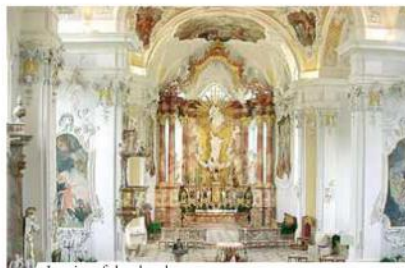
Interior of the church